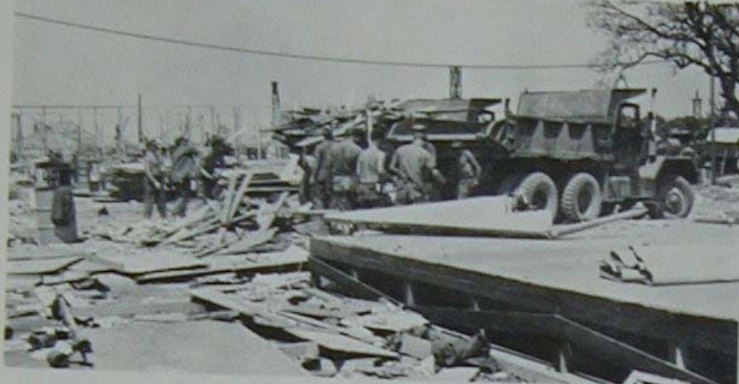
Wreckage flies through the air as salvage crews load dump trucks at Camp Monahan. Studs for the chow hall are seen in the background.