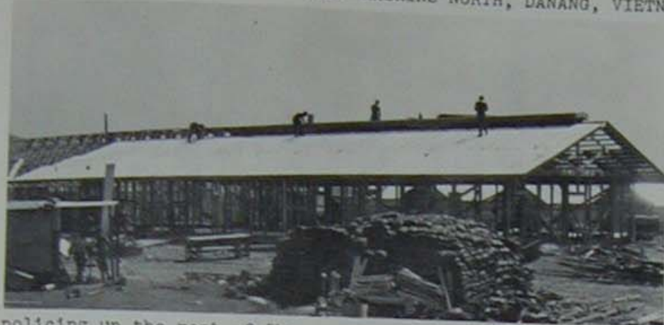
Seabees on a hot tin roof nail down sections of sheet metal on a portion of the chow hall.