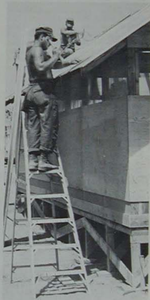
A builder hammers down the final section of roofing on a hut while two CEs rig up the wiring.

So when the Marines finally moved back into their camp, they were more than satisfied. But that's why the Seabees are here in the first place--to support the Marine and Army units in the Republic of Vietnam.