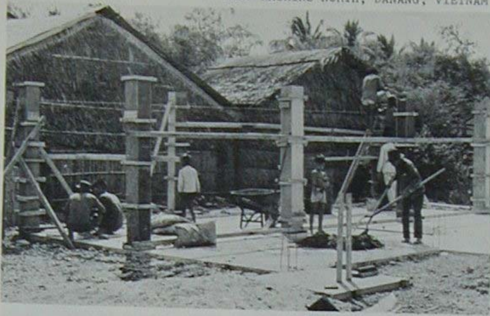
Builder trainees of Seabee Team 5301 pour columns at Phe Me village in the province of Ba Xuyen. The columns are part of the now completed village headquarters building.