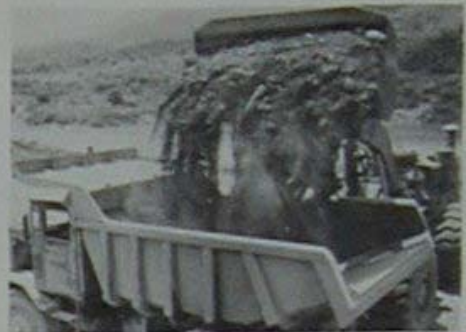
A front-end loader fills a dump with rock at the Quarry site west of Vinh Dai.

Well, until the next time, we're all hanging in there!!