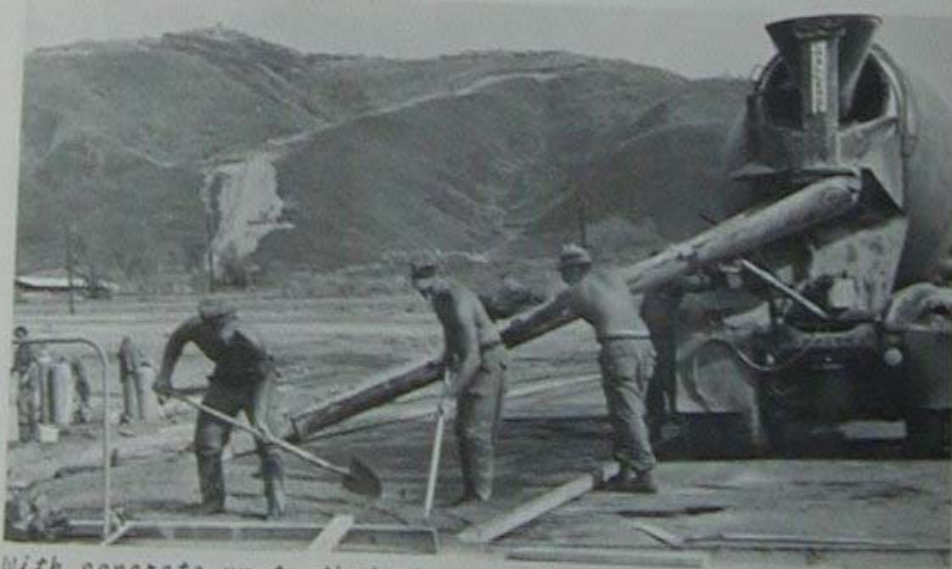
With concrete up to their knees two builders lay the slab for a butler building while a TM driver guides the flow from his truck.