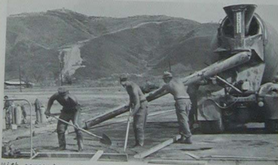
With concrete up to their knees two builders lay the slab for a butler building while a TM driver guides the flow from his truck.