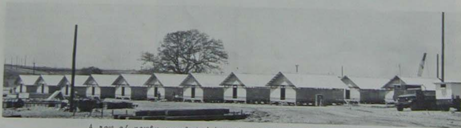
A row of newly completed hootches gleam in the sunshine.