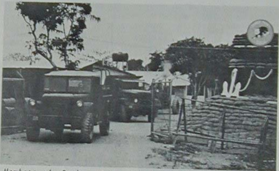
Members of Seabee Team 5301 at Soc Trang leave their camp for another day of teaching South Vietnamese trainees.