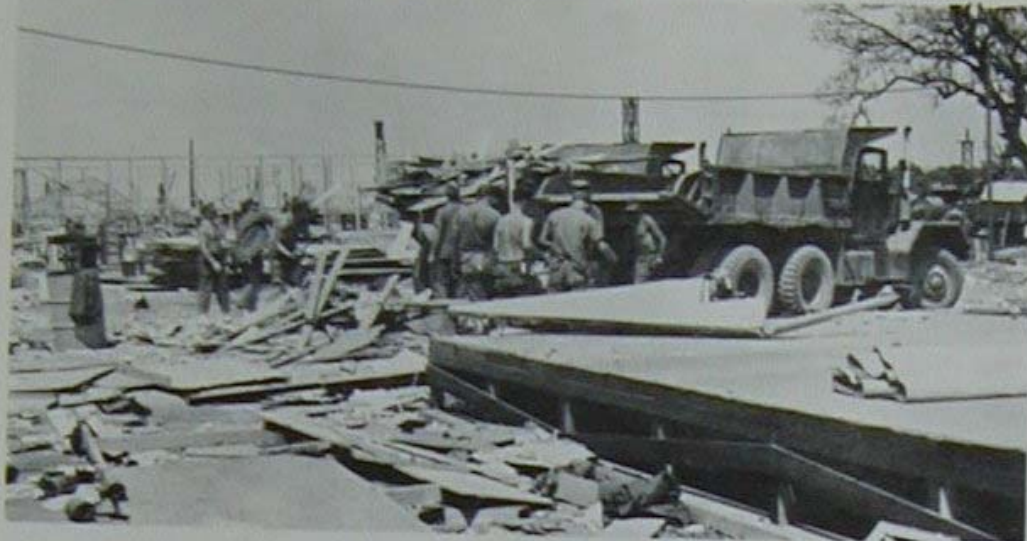
Wreckage flies through the air as salvage crews load dump trucks at Camp Monahan. Studs for the chow hall are seen in the background.