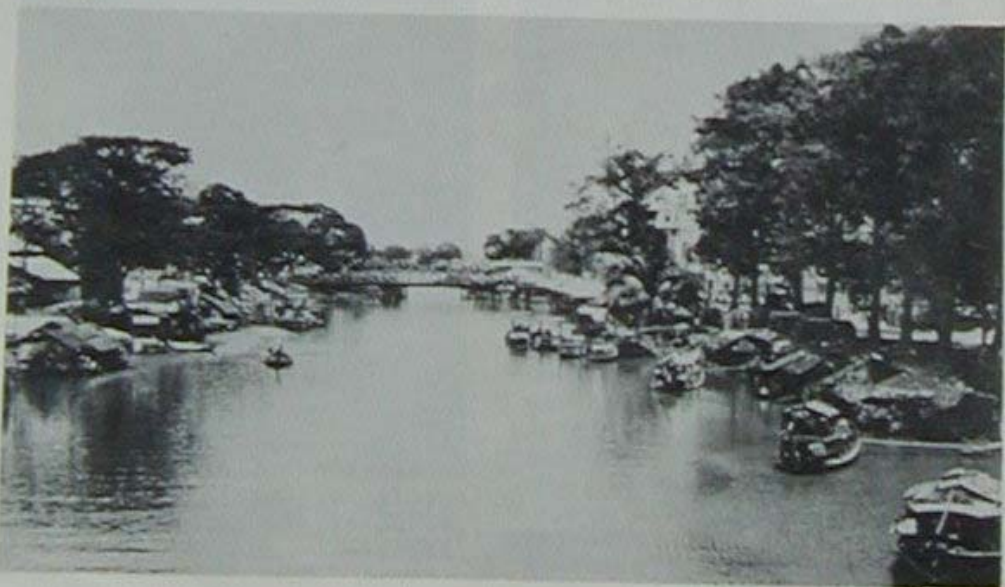
Boats dock along the banks of one of the many canals that interlace the cities and villages in Ba Xuyen province where Seabee Team 5301 is working. The canals are the principal means of transportation, especially during the monsoon season.