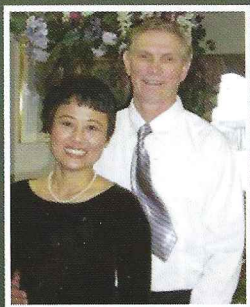
Miss Saigon was 12 and I was 22, 1969. I was a Seabee MCB 53 and 10 in 1970. Steelworker welder E-5.